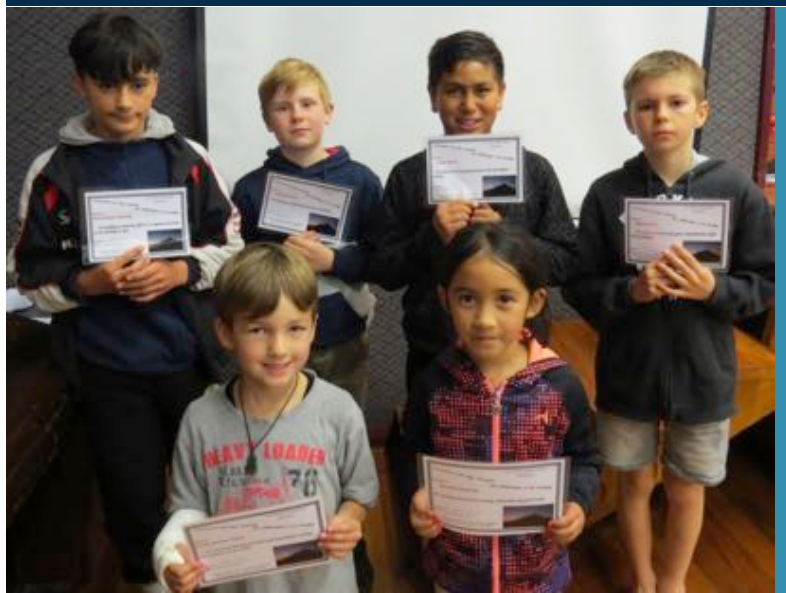
Absent from the photo: Tyrece Squire