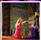
Courageous Esther saves her people

be STRONG & Courageous do not be afraid DO NOT BE DISCOURAGED FOR THE LORD YOUR GOD will be with YOU WHEREVER YOU GO Joshua 1:9