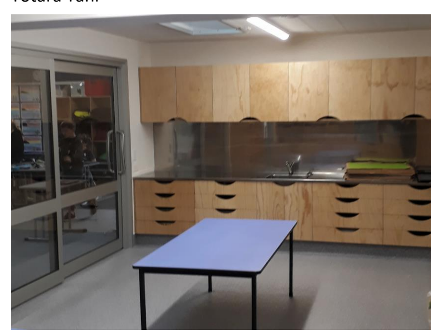
Break out Space