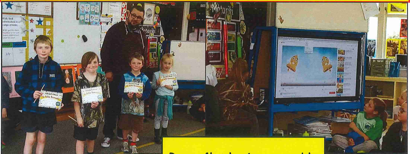
Room 4's sharing assembly