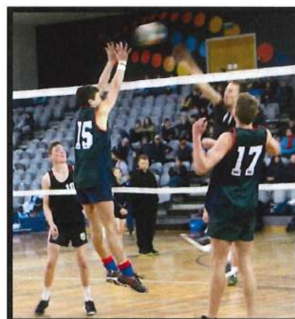
Images from the NZ Area Schools Tournament in Dunedin