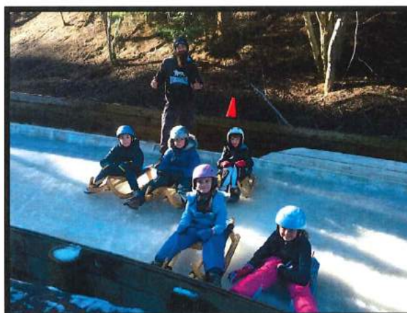
Picture of the Year 4 kids on the luge in Naseby.