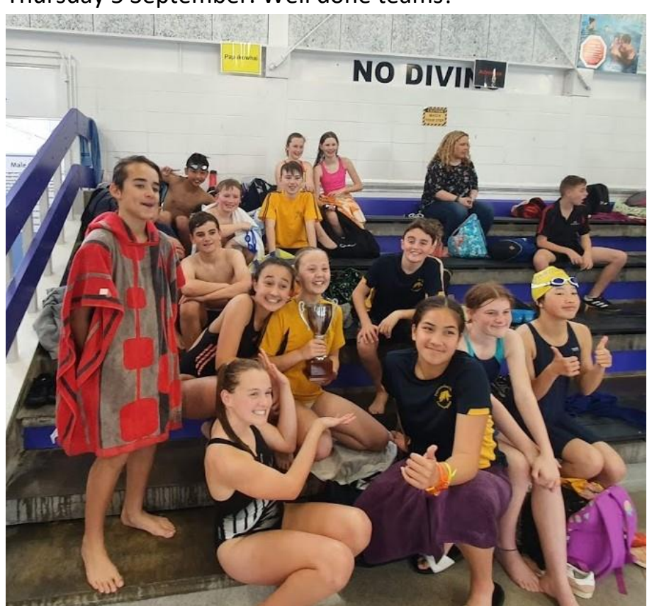
Year 7 and 8 champions

Congratulations to all the students that took part in the Parumoana inter-schools swimsports last week. The teams did exceptionally well with the Year 7&8 team winning the Porirua City Aquatic Cup on Friday 6 September and the Year 5&6 team placing second in their competition on Thursday 5 September. Well done teams!