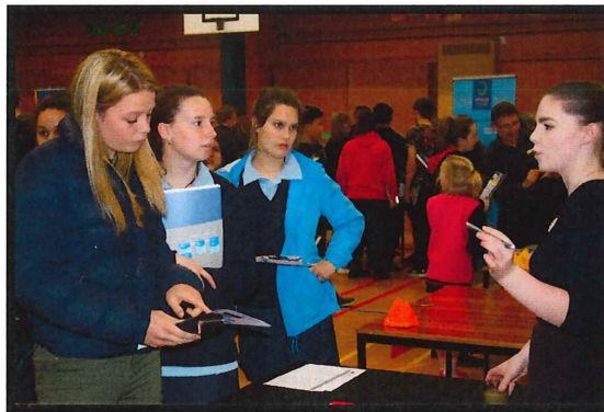
Photos from the EOHS Careers Expo