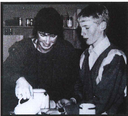
1987 School Formal

The Fourth formers were responsible for the Meteorological Station...in rain, hail, sleet and snow (and even sunshine some days!) they would take recordings twice a day (even at the weekends). They would read thermometers (air, grass, ground temperature), take evaporation readings, rainfall, wind speed and direction and at 3pm ring the temperature to the meteorological office in Henly, where it was recorded and sent onto the TV studio for 'The South Tonight'. The one and only perk of the job was an end of year trip to Dunedin.